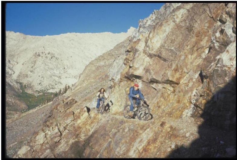
Now This Is Mountain Biking